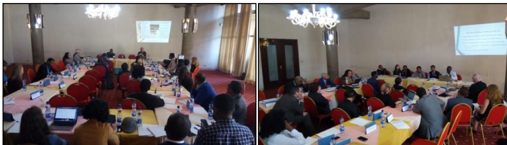
Academic International Conference at Ghion Hotel 13 and 14 December 2019