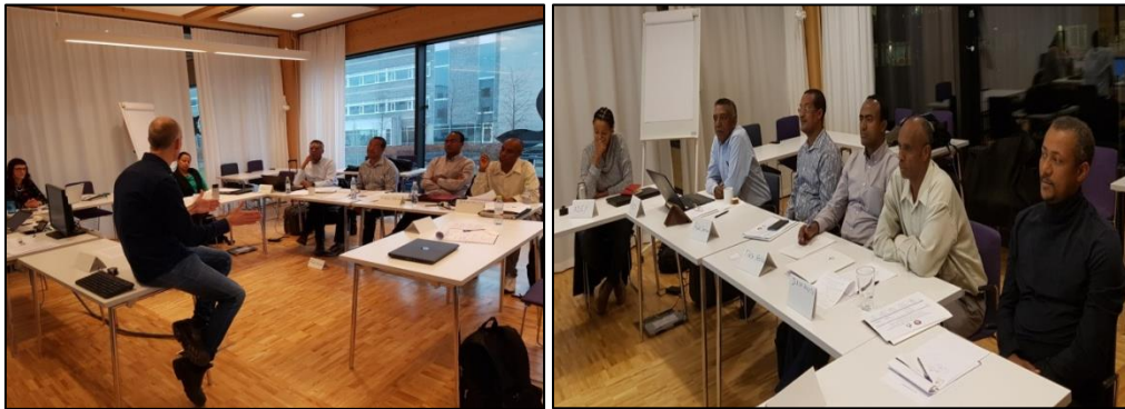
Training of Institute of Biotechnology staffs on Doctoral supervision training in Sweden

Institute of Biotechnology staffs (6 in number) trained on supervision and mentoring of graduate students during their education and research as well as research laboratory management.