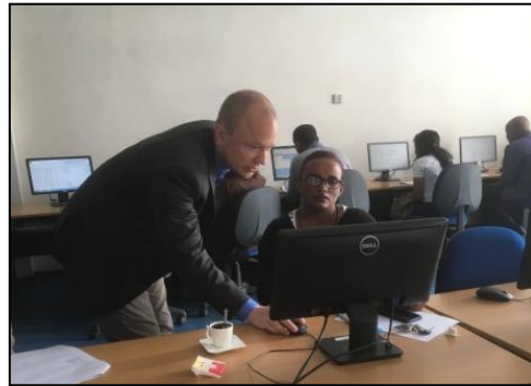
Photos from Excel training

Cultural Exchange between SPCO staffs and Professors from Sweden 13 December 2019