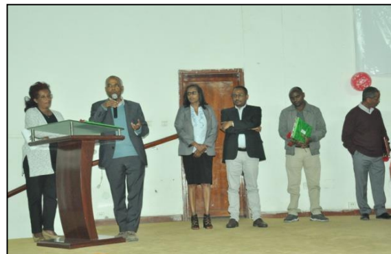
Photos from a panel discussion