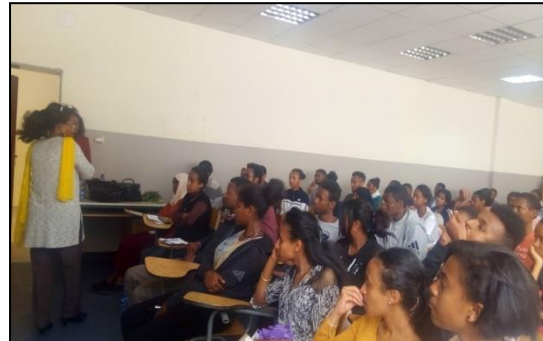
Photos from life Skill training