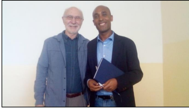
Photo from public lecture by Thomas Pokewitz at AAU December, 16 2019