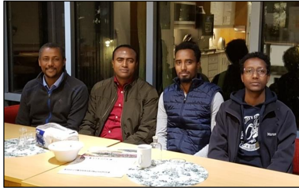
Institute of Biotechnology supervisors (left side) discussed with PhD students (right side) on their activities in SLU