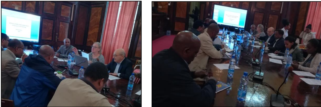
Photo from AAU- Sida 40 th Anniversary Meeting, AAU, Senate Hall, 11 December 2019