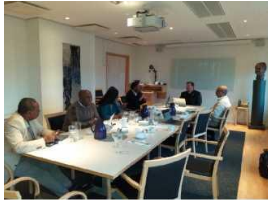
Benchmarking visit of the Office of the Vice President for Research and Technology Transfer of Addis Ababa University to Gothenburg University, Sweden