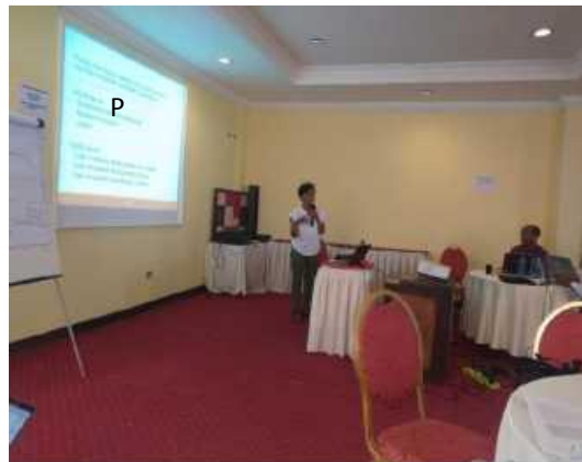
Part of the Supervision training organized by the Research Directorate of Addis Ababa University and conducted by Gothenburg University, Sweden, in Bishoftu, Ethiopia