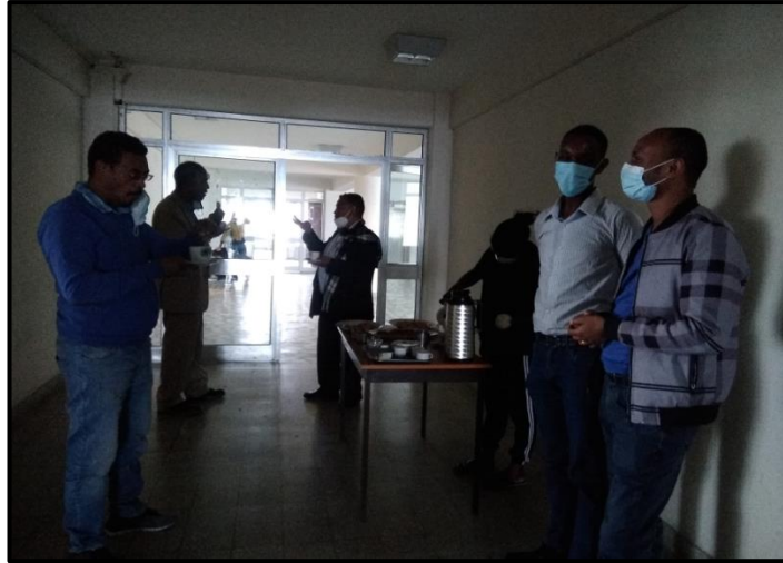
Health-break (Tea & Coffee): Some participants of the second-round training of the tenants comforting during the tea-break