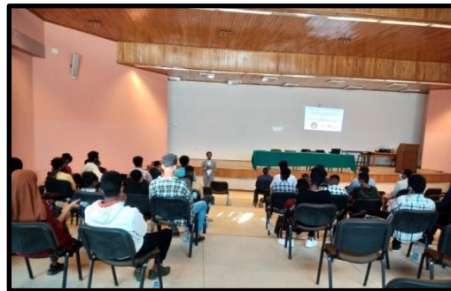
Closing Program (January 31, 2021): Trainees, trainers and invited guests attending the closing program of the training workshop at the auditorium of Addis Ababa Institute of Technology (AAU-AAiT)