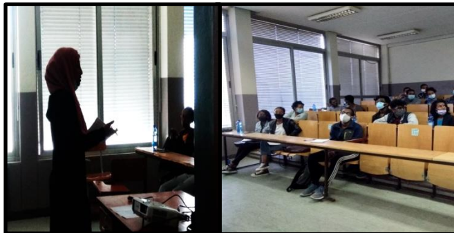
Presentation (Section-2 at D-Building of AAiT – Room #28): Trainees presenting activities related to part of their project following syndicate discussions in group.