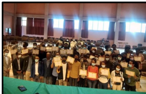
Group photo: Certified trainees with their trainers, invited guests, and the organizing committee