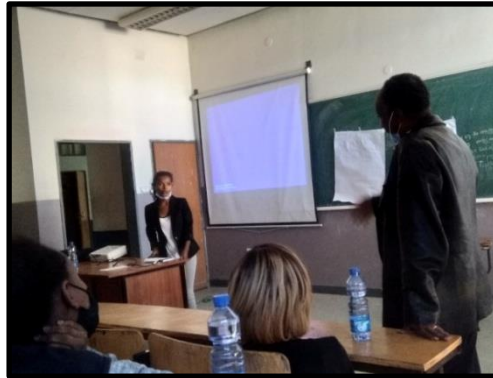
Time for Feedback: Trainees taking feedback from their trainers and classmates following the presentation related to their project.