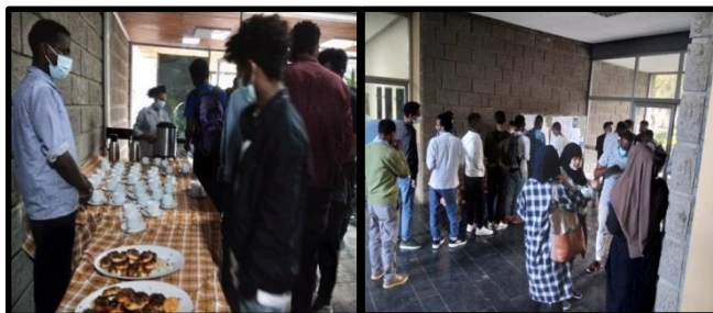
Health Break: D-Building of AAiT, AAU