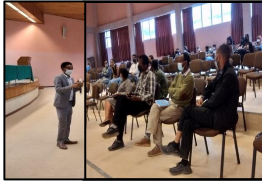
Pre-training Orientation (January 22, 2021): Registered and selected applicants along with their trainers attending the orientation program at the auditorium of the Addis Ababa Institute of Technology (AAiT), Addis Ababa University.