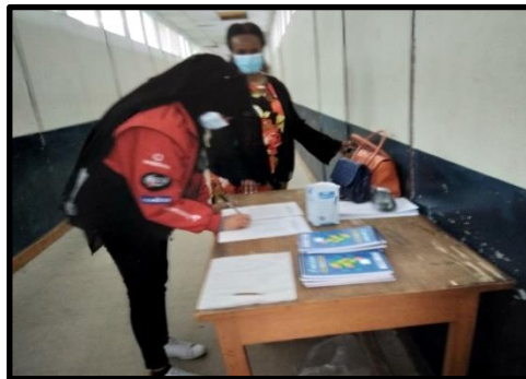
Signing first-day attendance (January 25, 2021): Trainees signing attendance and collecting training materials at AAiT